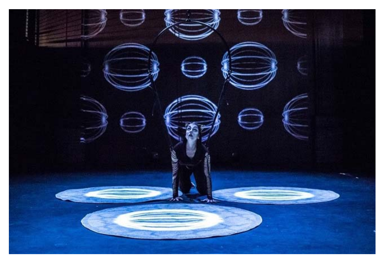
Cirque de Vol Studios' The Fringe Dwellers: Time as a Symptom stars Toni Craige

The work of the cast and crew began before the doors were opened. A combination of projection, stage lighting, music, and experimental sound effects greets you as you enter the auditorium. On the stage are three large white circles (projection spaces) around which dancers are slowly moving. This is not to present any narrative or inform the audience of what is about to happen . Rather, its intention is to inform the audience of where they are . The program encourages the audience to relax, remain present, and experience the performance.